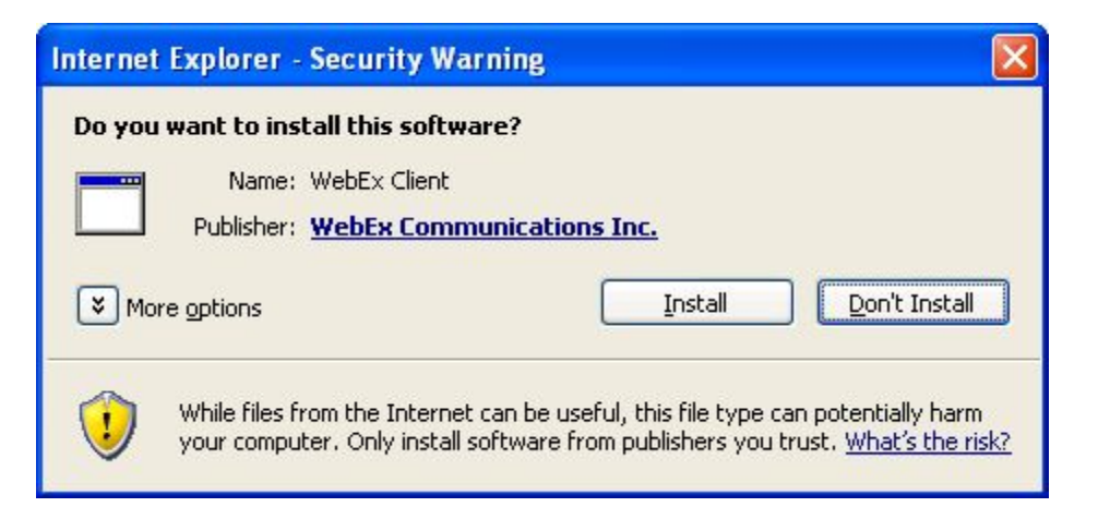
Figure 3 – Security Window

5. When the Security Warning window pops up, click on the " Install " button as shown in Figure 3 below :