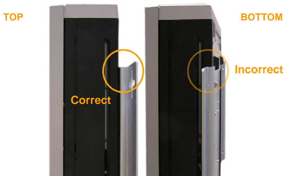
Figure 2.1 OfficeServ 7100 Cabinet Side View—Bracket Angle Out