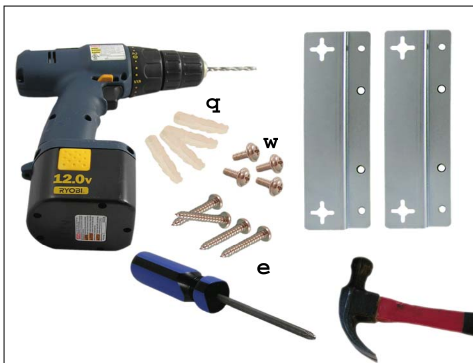
Figure 1. Required Tools for Wall Mounting