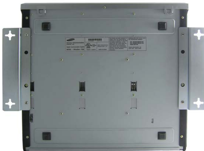
Figure 2.2 OfficeServ 7100 Cabinet Bottom View—With Brackets

Samsung Telecommunications America Business Communication Systems 1301 East Lookout Drive Richardson, TX 75082