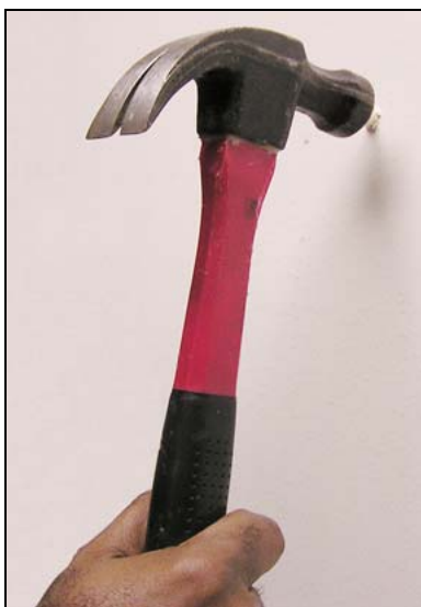
Figure 2.5 Hammering plastic anchors