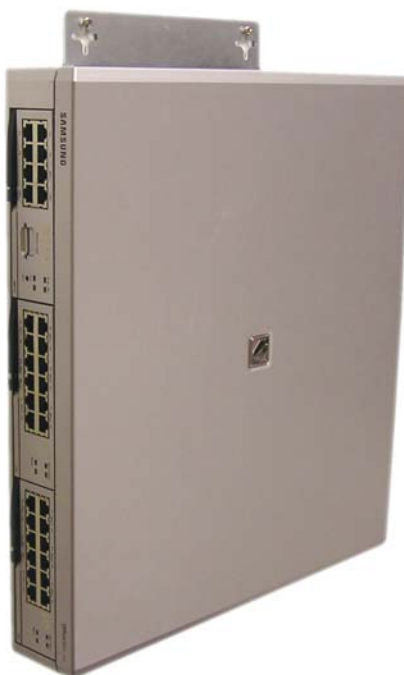
Figure 2.6 Side View Wall Mounted 7100 Cabinet

Samsung Telecommunications America Business Communication Systems 1301 East Lookout Drive Richardson, TX 75082