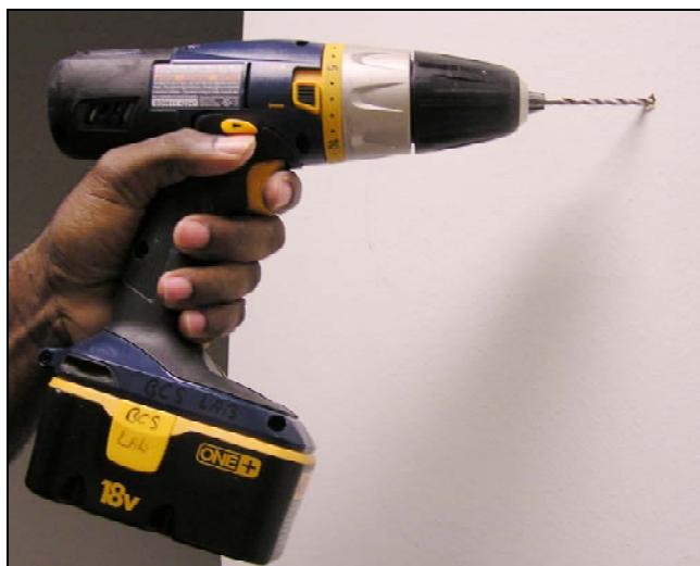
Figure 2.4 Making holes for top and bottom brackets

Samsung Telecommunications America Business Communication Systems 1301 East Lookout Drive Richardson, TX 75082