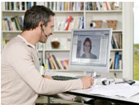
Samsung makes telecommuting a practical and cost-effective alternative for your business.

Managing your business can be an all consuming task, but Samsung has your communications needs covered so you're free to focus on your core competencies. The advanced features and functionality of Samsung's solutions provide your company with a more refined professional image. So whether you need the efficiency of a basic phone system or a fully converged communications platform, our lineup of systems delivers the perfect blend of versatility and power your business needs.