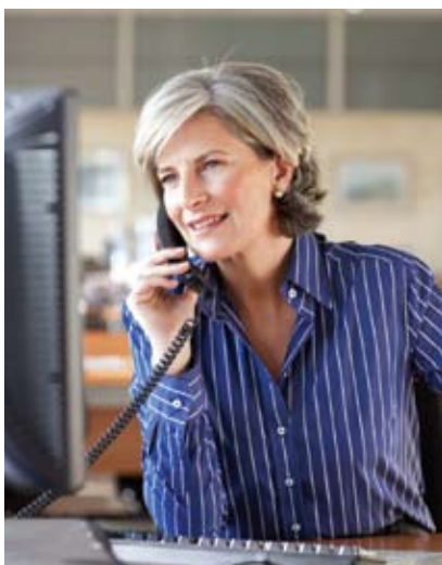
The OfficeServ 7000 Series Business Communications Solutions enable users to save time and enhance productivity.

Business today is all about advantage. How to secure it and how to maintain it – all without diminishing your assets. What good is investing in advanced technology if it doesn't advance your competitive edge? For over 70 years and counting, Samsung understands. Global awards? We have them. International acclaim? We've earned it. Yet, our most impressive triumphs are those we help our customers achieve every day. A better looking bottom line. Increased productivity. Enhanced customer service. With Samsung, people and products collaborate to produce extraordinary results.