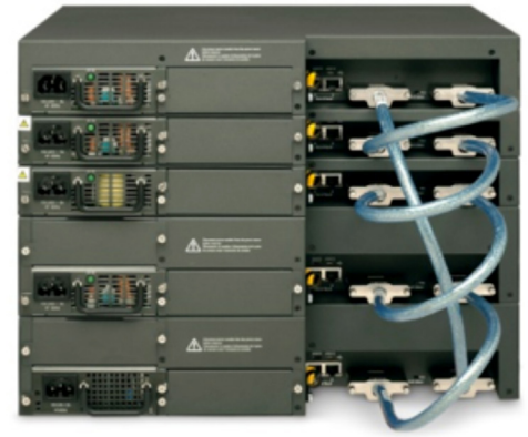
ERS 5600 Stacking Cable Inteconnection

From a management perspective, our Stackable Chassis appears as a single networking entity – utilizing only a single IP Address. This can significantly reduce the number of switches to be managed within the network as a stack of up to 8 switches can be managed just as easily as a single switch. Distributed real-time monitoring of the Stackable Chassis also provides an at-a-glance view of operational status and health which