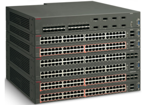
ERS 5600 stackable chassis system

Premium Stackable Chassis system providing the resiliency, security and convergence-readiness required for today's high-end wiring closets, high-capacity data centers and network core environments.